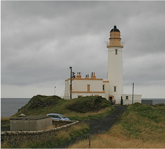
Turnberry Lighthouse ILLW UK0000

A few years ago the International Association of Lighthouse Keepers decided to have an annual open day for lighthouses all around the world to encourage visitors to visit at their lighthouses. They decided that no better day could be decided upon other than the Sunday of the ILLW. This move has been highly successful as the media have become involved in quite a few of the countries involved in the event.