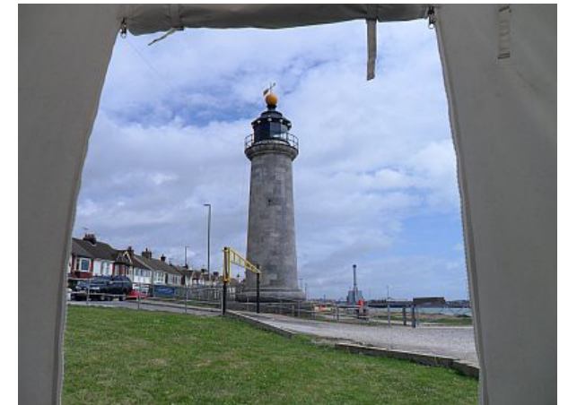
Shoreham Lighthouse, Southern England.

For some reason or other August seems to have become the international weekend for lighthouses. Countries all over the world have become involved in one for or another of lighthouse activity. Some years ago the United States Congress declared August 7th as their National Lighthouse Day and during that first week in August amateur radio operators in America set up portable stations at lighthouses and endeavour to make contact with each other. This event is known as the US National Lighthouse Week and is organized by the Amateur Radio Lighthouse Society, ARLHS, which was founded in 2000.